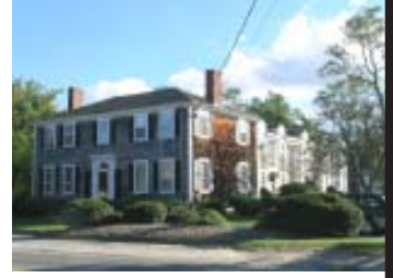
Route 6A Yarmouthport Commercial Office Building