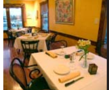
Falmouth Brazilian Steakhouse Emporio