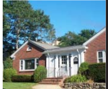
Commercial Office Building on West End Rotary, Hyannis MA