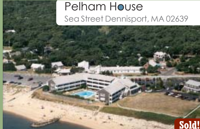
Pelham House Sea Street Dennisport, MA 02639